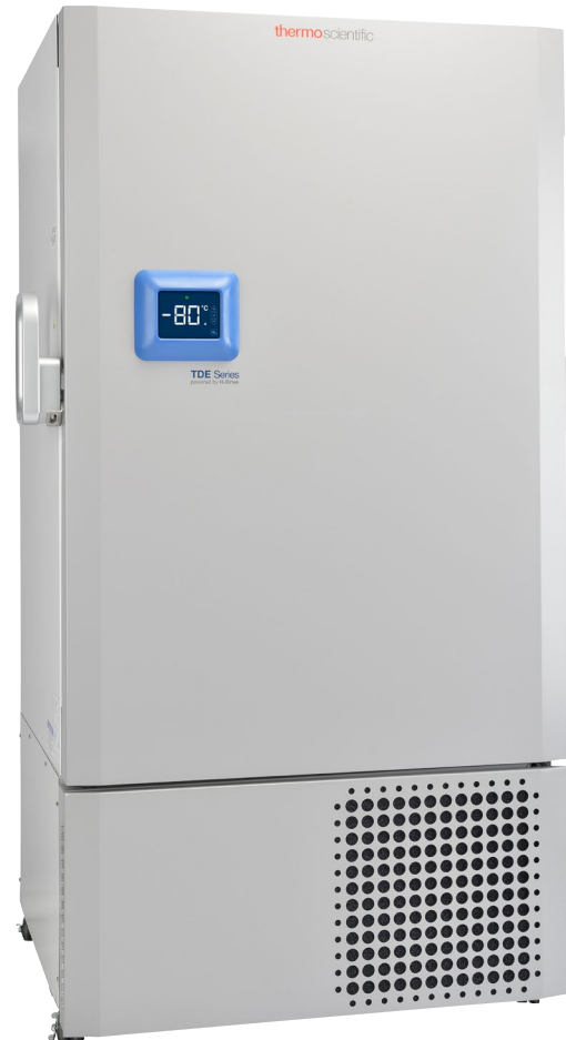
TDE Series ULT freezer (Cat. No. TDE60086FD).

Energy and cost from using heating, ventilation, and air conditioning (HVAC) should also be taken into consideration when evaluating the total energy usage for larger equipment. Heat generated by a freezer is displaced into the room and must be removed by the HVAC system. TDE Series ULT freezers emit less heat into the room, which lowers HVAC costs. For example, the TDE40086FD model emits 1,474 BTU/hr compared to 3,099 BTU/hr for a 5-year-old TSE400D model. Therefore, choosing the TDE40086FD model to replace an aging TSE400D unit could translate into a total energy cost savings of $565 annually (Table 2) [5].