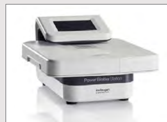
Power Blotter System (top) and Power Blotter XL System (bottom).