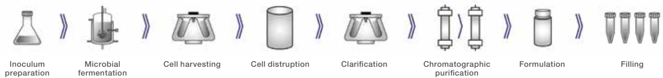
Figure 2. Conventional manufacturing process for recombinant enzymes, with risk of DNA contamination. The process of enzyme preparation is repeatedly exposed to potential DNA contamination from open environments and human operators. In addition, there is a risk of carryover DNA contamination from previous manufacturing material through shared equipment.