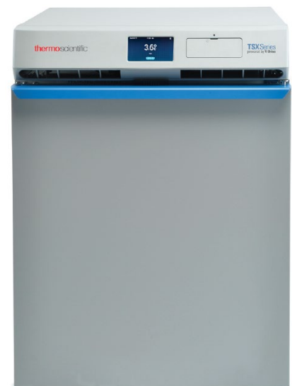
TSX Series high-performance undercounter refrigerator

Thermo Fisher has phased out use of these refrigerants in our freezers and refrigerators in favor of using more environmentally friendly hydrocarbon alternatives. Our commitment to environmental responsibility doesn't end there. The TSX Series refrigerators also offer 42% more storage capacity than the previous model (Cat. No. REL404A) in a similar footprint. This promotes the efficient use of laboratory space and cold storage. Finally, the quiet operation of the TSX Series refrigerators (35 dB; the previous model operates at 60 dB) allows them to be located conveniently inside the lab.