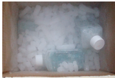
Figure 2. Biotainer bottles after completion of vibration, drop, low-pressure, and compression testing.