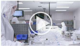
Global manufacturing capabilities overview

Watch these videos to learn more about how we are expanding our global single-use manufacturing network: