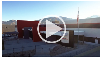
Logan, UT, and Millersburg, PA