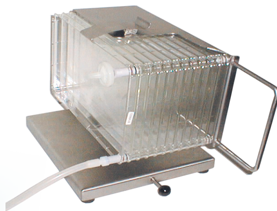
10-layer Nunc Cell Factory hand manipulator system