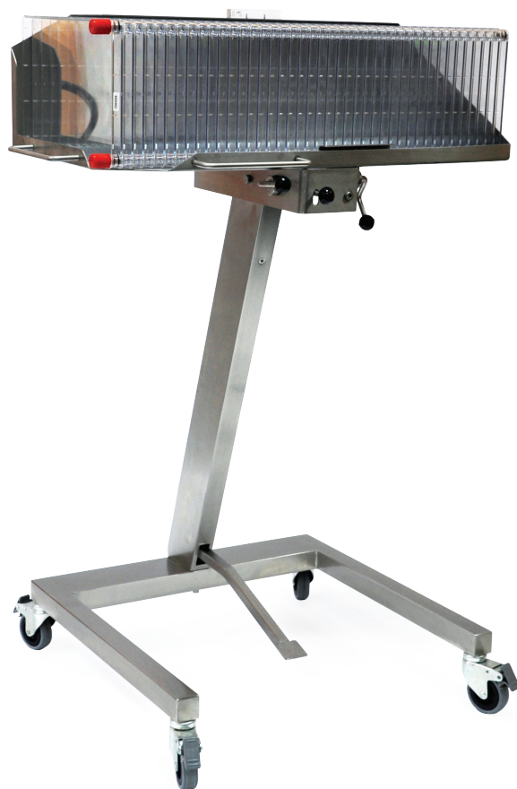
40-layer Nunc Cell Factory hand manipulator system