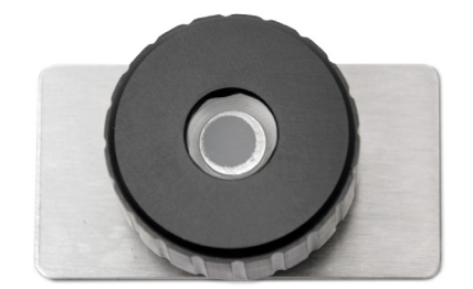
Figure 1: Transfer cell maintains sample in an inert environment for ex situ analysis of Li-ion battery materials