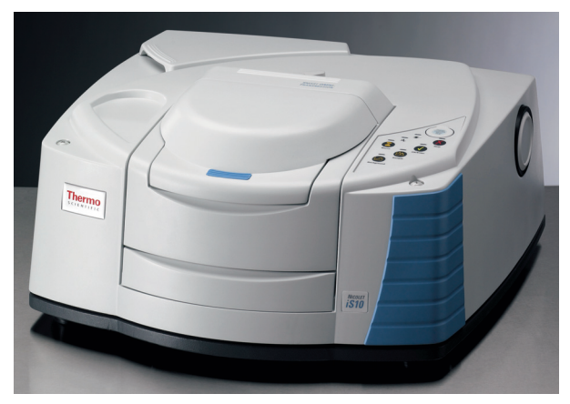
Figure 2: The Thermo Scientific Nicolet<sup>™</sup> iS<sup>™</sup>10 spectrometer is ideal for gemstone analysis

The data were collected using the Thermo Scientific OMNIC<sup>™</sup> software. A small number of scans was needed (4-16) to see the presence of resin; the spectra shown here were collected over a longer time (64 scans) to improve the s/n ratio. A resolution of 4 cm<sup>-1</sup> was easily sufficient. The full spectrum was obtained, but the glassy nature of the material obscured all signals below 2300 cm<sup>-1</sup>; the critical range is between 2600 and 3800 cm<sup>-1</sup>, so this is no impediment to the analysis.