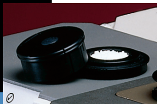
Figure 2: Antaris II analyzer with the closed sample cup and spinner

Three or four samples of each herb were scanned with an Antaris™ II FT-NIR system in the range between 10,000 and 4,000 \text{cm}^{-1} . The materials were placed in a closed rotating sample cup with a 30 mm window over the