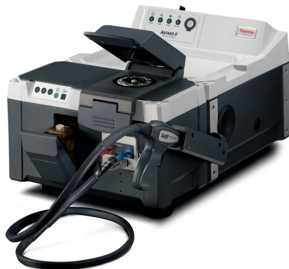
Figure 1: The Thermo Scientific Antaris II FT-NIR analyzer showing different available detection options

Researchers at IREL, spol. s.r.o. (Brno, Czech Republic) explored FT-NIR spectroscopy as a means to rapidly identify herbs used to produce extracts found in nutraceuticals, cosmetics and pharmaceuticals. Their biological origin means that many herbs contain similar components, like cellulose, proteins and sugars, which tend to result in similar spectra. The purpose of this application note is to demonstrate that complex herbal materials can be correctly classified using FT-NIR spectroscopy much more rapidly than conventional techniques.