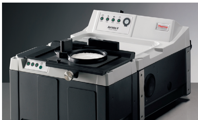
Figure 1. Antaris II MDS FT-NIR Analyzer. The lactose samples were placed in the Spinning Sample Cup Holder on the Integrating Sphere module as shown. Diffuse reflection spectra were collected in the range between 4000 and 10000 \text{cm}^{-1} . Each mesh-size was sampled 10 times.

Example spectra are shown in Figure 2, demonstrating typical differences between various particle sizes of the same material.