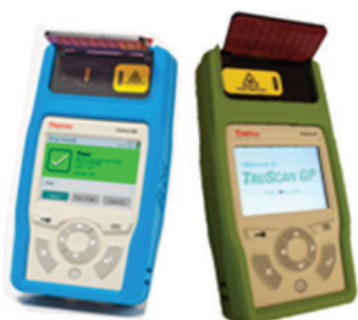
Thermo Scientific™ TruScan RM™ and TruScan GP™ spectroscopic analyzers employ the probabilistic approach.

An alternative to correlation-based library searches and a development-intensive classification method that has seen increased adoption in recent years is the comparison of measured data to library spectra in a probabilistic fashion. The probabilistic approach has been used on Thermo Scientific™ handheld Raman and Infrared devices since their inception.