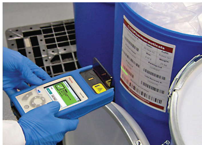
Field-based analysis with high accuracy.

To further illustrate the effectiveness of the probabilistic approach, we will consider the probabilistic comparison of 15% DMMP in chloroform to pure chloroform, as shown in Figure 2. In this case, we examine the unknown measured spectrum and the pure chloroform library spectrum, testing the null hypothesis ( H_0 = pure chloroform) and the alternative ( H_1 = not pure chloroform). With this assessment, it becomes very clear that the discrepancy in the 715 \text{cm}^{-1} region cannot be due to noise alone. The p-value is the probability of observing the unknown spectrum or one more extreme, if the null hypothesis is true. For this comparison, the value is calculated as 6.1 \times 10^{-4} . Thus, if the sample were pure chloroform, the probability of observing a spectrum as extreme as the unknown measurement would be ~ 1 in 1639 – highly unlikely. Correspondingly, the algorithm would recognize that the sample cannot be pure chloroform, returning a p-value less than 0.05 (i.e. statistically significant).