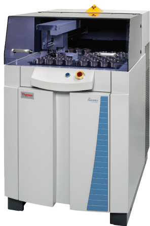
Thermo Scientific ARL PERFORM'X Series advanced X-ray fluorescence spectrometer

ARL PERFORM'X 4200 W, chlorine analysis in fuel oils, XRF, X-ray fluorescence