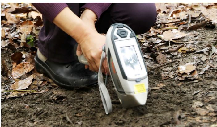
Thermo Scientific portable XRF analyzer for instant analysis of heavy metals along the coast of Hsinchu county.