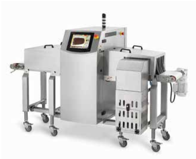
Thermo Scientific™ NextGuard™ Pro X-ray Inspection System (not shown with complete M&S capability)

Metal detectors can be used at low frequency with products that have metal in their packaging, but in most cases the sensitivity will be much improved if X-ray is used. This includes packs with metallized film, aluminum foil trays, metal cans and jars with metal lids. X-ray systems can also potentially detect foreign objects like glass, bone or stone. The NextGuard X-ray system is available with all the capabilities to satisfy retailers like M&S in these cases.