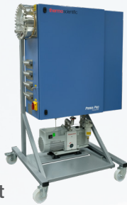
Thermo Scientific Prima PRO Process Analyzer