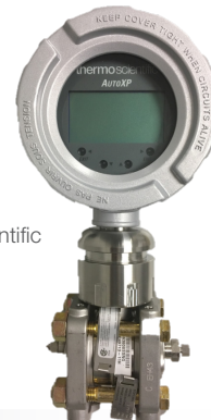
Thermo Scientific AutoXP