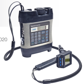
Thermo Scientific TVA2020 Toxic Vapor Analyzer