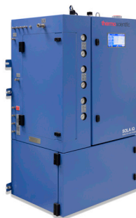
Thermo Scientific SOLA iQ Sulfur On-line Analyzer