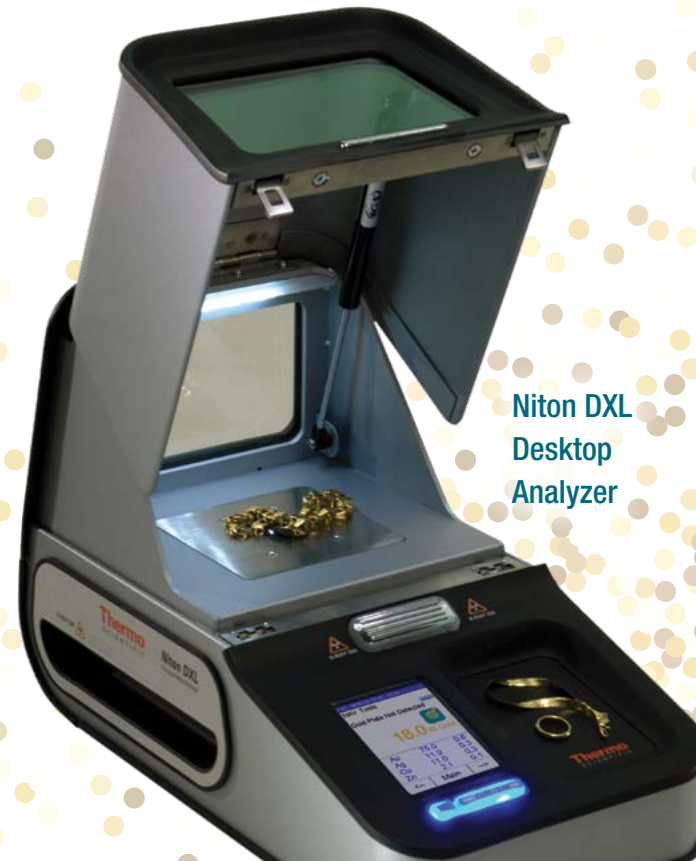
Niton DXL Desktop Analyzer