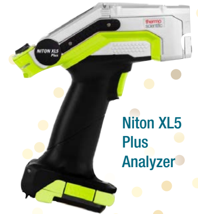
Niton XL5 Plus Analyzer