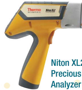
Niton XL2 Precious Metal Analyzer

Unlike traditional test methods, all precious metals and alloys, in various size and shapes are tested completely non-destructively.