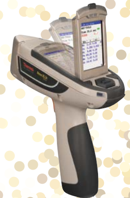
Niton XL3t GOLDD+ Analyzer