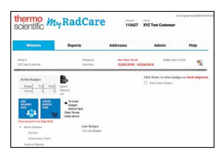
Account at a glance

MyRadCare operates on secure servers and uses the latest encryption technology to ensure all of your online information is protected.