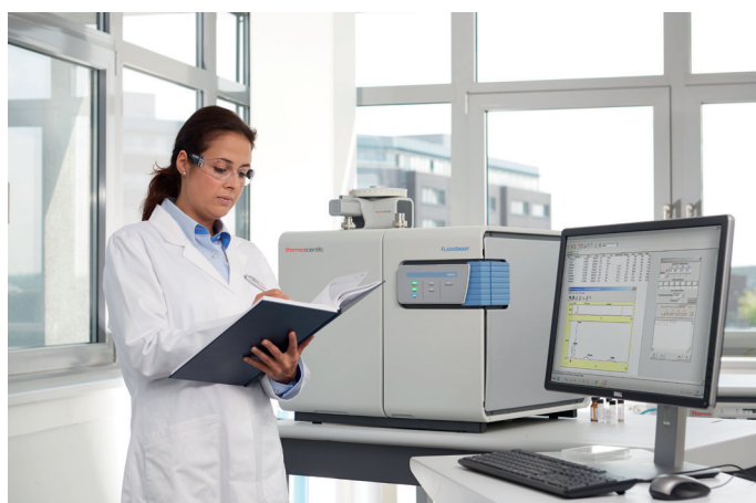
Figure 1. Thermo Scientific FlashSmart Elemental Analyzer.

The Thermo Scientific™ FlashSmart™ Elemental Analyzer, based on the dynamic flash combustion of the sample, copes effortlessly with a wide array of laboratory requirements, such as accuracy, day by day reproducibility and high sample throughput.