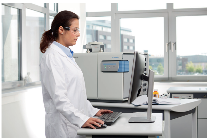
Figure 1. Thermo Scientific FlashSmart EA Elemental Analyzer.

In many countries quality control of flour is strictly regulated. One of the most important parameter is the determination of protein content. The monitoring of its amount, through the determination of nitrogen must be accurate in order to verify the nutritional quality of these products. The Thermo Scientific™ FlashSmart™ Elemental Analyzer (Figure 1), which operates with the dynamic flash combustion of the sample, meets many important analytical requirements, providing accuracy, day by day reproducibility and high sample throughput.