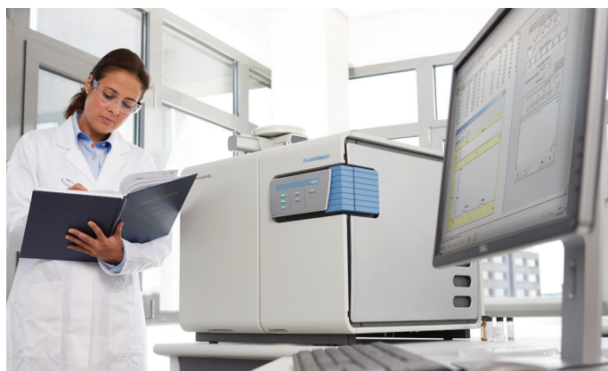
Figure 1. Thermo Scientific FlashSmart Analyzer.

The globalized market for food products requires accurate control of product characteristics in order to protect commercial value, to safeguard consumer health and manufacturer reputation. Official regulations establish protein content and labelling requirements, which enable consumers to define price and make quality comparisons. This means that protein analysis is an issue of significant economic and social interest because of the legal, nutritional, health, safety and economic implications for the food and animal feed industries. A common test used in the production process to determine the protein content is nitrogen analysis which is periodically monitored.