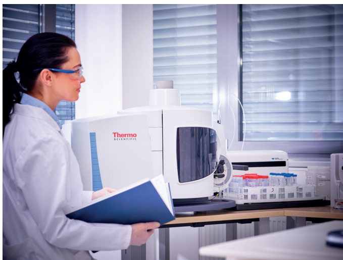
Figure 1. Thermo Scientific iCAP 7000 Plus Series ICP-OES.

For this analysis the Thermo Scientific™ iCAP™ 7600 ICP-OES Duo was used with the organics sample introduction kit, consisting of the components listed in Table 2. The duo system configuration was chosen because of its ability to detect trace elements such as toxic heavy metals (arsenic, cadmium, lead) and major nutrient components. A Teledyne CETAC ASX-560 autosampler was used to transfer the sample to the introduction system of the ICP-OES. The Thermo Scientific Qtegra™ Intelligent Scientific Data Solution™ (ISDS) Software was used for data acquisition and provides easy options for post-analysis data manipulation.