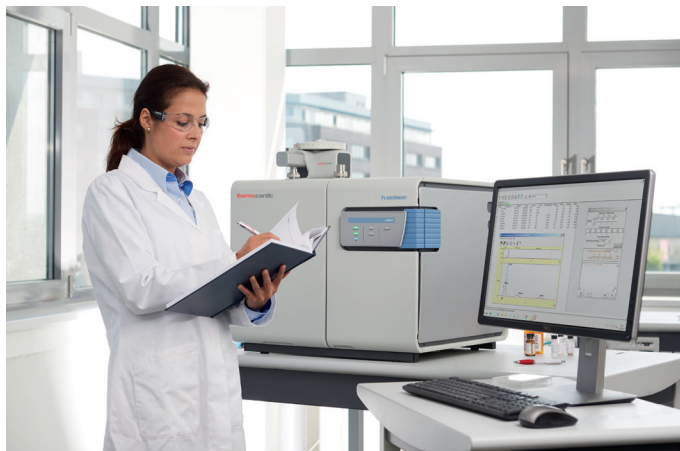
Figure 1. Thermo Scientific FlashSmart Elemental Analyzer.

Trace sulfur content can be accurately determined. Sample protein content is calculated automatically using a conversion factor in the Thermo Scientific™ EagerSmart™ Data Handling Software.