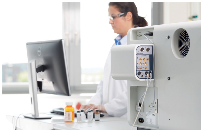
Figure 2. MultiValve Control (MVC) Module.

This note presents N/Protein and sulfur data of several food and animal feed samples in a wide range of types and concentrations, measured with the FlashSmart EA. Results are shown to demonstrate its repeatability, accuracy and precision.