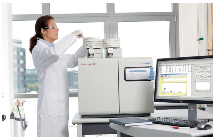
Figure 1. Thermo Scientific FlashSmart EA.

The Thermo Scientific™ FlashSmart™ Elemental Analyzer (Figure 1), based on the dynamic combustion method (modified Dumas method), provides rapid and automated nitrogen and sulfur determination without use of hazardous chemicals and offers advantages in precision over traditional methods.