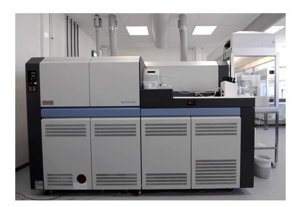
Figure 1: Thermo Scientific<sup>™</sup> Neptune<sup>™</sup> Series MC-ICP-MS

All these processes not only occur today, but have also occurred on the early Earth in similar forms, leaving their mark in the isotopic ratios. Comparing the isotopic signatures from then and today is a powerful strategy to a better understanding of the evolution of our planet Earth.