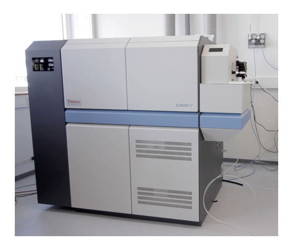
Figure 3: Thermo Scientific<sup>™</sup> Element<sup>™</sup> Series HR-ICP-MS