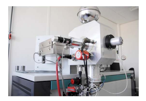
Figure 2: Thermo Scientific<sup>™</sup> Triton<sup>™</sup> Series TIMS