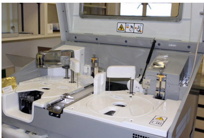
Interior view of the Gallery Plus discrete analyzer

The instrument's basic principal of operation is as follows: A specific amount of liquid sample is automatically dispensed into a small cuvette. Between one and three method-specific reagents are then automatically dispensed into the same cuvette. After a timed incubation, the reagents will cause color to develop in the sample proportional to the analyte concentration. The color intensity of the sample is then measured at a specific wavelength by the instrument and converted to a concentration with the aid of a blank and a calibration standard. Quality control is achieved by means of an independent standard measured in the same manner. The instrument has the capability to automatically dilute and reanalyze a sample that has exceeded the measuring range. Electrical conductivity and pH is measured by a separate instrument module. The instrument is fully compatible with the prescriptions and regulations of the International Organization for Standardization ISO-17025 laboratory accreditation standard.