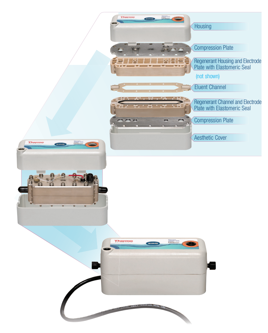
Figure 2. The Dionex ERS 500 suppressor components and assembly

Additionally, this suppressor is an integral part of RFIC systems, where the sample is determined using suppressed conductivity detection in the lowest possible background of high-purity water. AutoSuppression means ease-of-use; you don't need to make regenerant because the suppressor is constantly regenerated by the continuous electrolysis of water derived from the cell effluent.