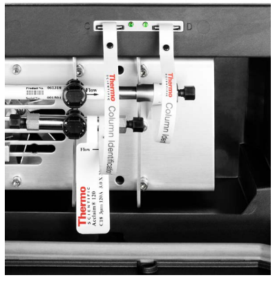
Figure 7. The column identification system enables automatic documentation of important column variables for regulatory compliance and improved laboratory management.

The card accompanies the column for its lifetime and carries all relevant information: the Chromeleon CDS documents, the column ID and column variables with every analysis, and allows automatic inclusion of this information in your reports.