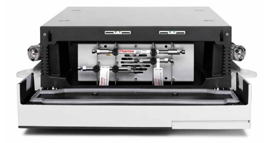
Figure 1. The UltiMate 3000 Rapid Separation and Standard Thermostatted Column Compartment provide room for up to 12 columns, depending on column length.