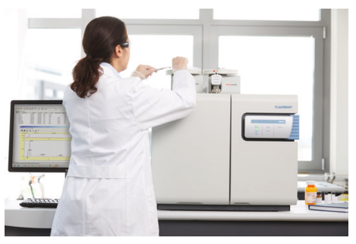
Figure 1. Thermo Scientific Flash Smart Elemental Analyzer.

Carbon, nitrogen, hydrogen and sulfur determination by combustion analysis are used in the characterization of raw and final products in pharmaceutical, cosmetics, universities and material industries for quality control and R&D purposes. The use of accurate and automated analytical techniques allow fast analysis with an excellent reproducibility whilst meeting laboratory demands for high productivity and low cost per analysis. The Thermo Scientific<sup>™</sup> FlashSmart<sup>™</sup> Elemental Analyzer (Figure 1) is equipped with two independent furnaces that allow the installation of two analytical circuits. These independent circuits can be controlled automatically through the Thermo Scientific<sup>™</sup> MultiValve Control (MVC) Module (Figure 2). This unique Module allows the Analyzer to be set-up for ultimate productivity by having an automated CHNS/CHNS configuration in one system. Each analytical circuit can receive its own autosampler.