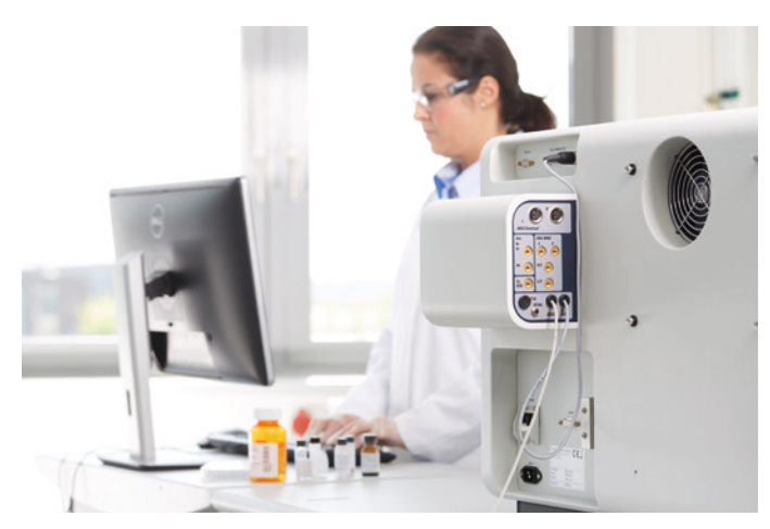
Figure 2. Thermo Scientific MVC Module.