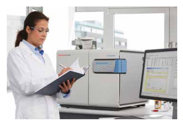
Figure 1. Thermo Scientific FlashSmart Elemental Analyzer.

Recently, laboratories have suffered from increasing analytical costs due to worldwide reduced availability and higher market prices of helium. Elemental analyzers, including the Thermo Scientific<sup>™</sup> Flash Smart <sup>™</sup> Analyzer (Figure 1), use helium as a carrier and reference gas during periods of sample analyses and instrument Stand-By Mode. There is therefore a demand for reduced helium consumption or the use of an alternative gas, such as argon, which is more readily available and at lower cost compared with helium.