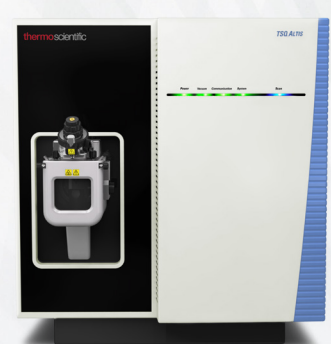
Thermo Scientific™ TSQ Altis™ Triple-Stage Quadrupole MS