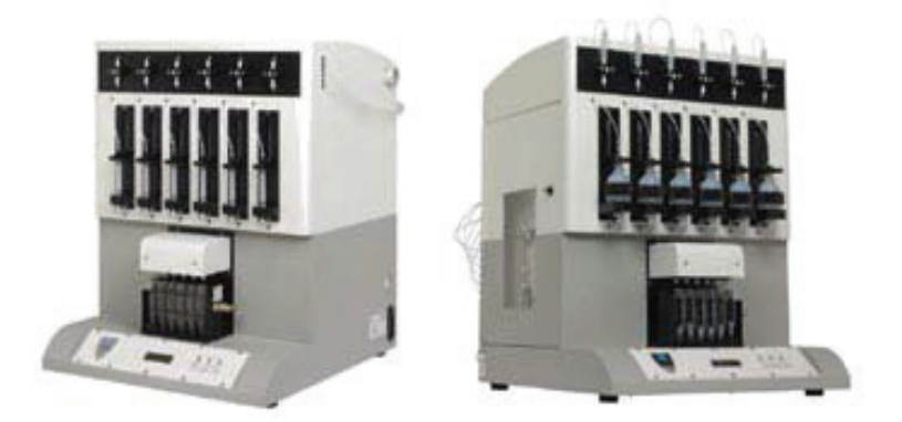
FIGURE 1. Dionex AutoTrace 280 SPE instrument cartridge system (left) and disk system (right).