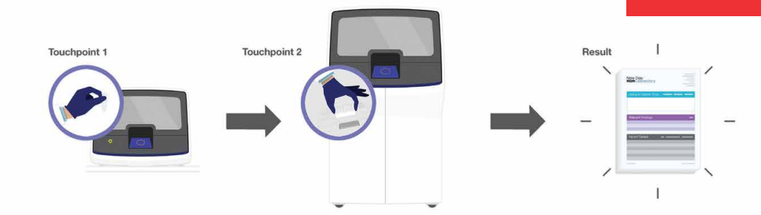
Figure 1: Touchpoint 1–(1) nucleic acid (NA) extraction, (2) NA quantification, (3) sequencing sample plate preparation, and (4) storage NA plate preparation; Touchpoint 2–(1) library preparation, (2) templating, (3) sequencing, and (4) analysis.

The Oncomine Precision Assay analyzes 78 variants, including mutations (45), CNVs (14), and fusion variants (19), across 50 key genes. Included are tumor suppressor genes such as TP53 , cancer drivers, and resistance mutations. Content has been carefully curated to include all relevant targets and also targets of emerging importance in precision oncology clinical research.