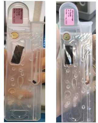
Figure 3: RapidHIT ID Sample Cartridge