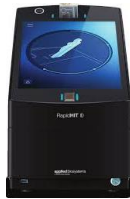
Figure 2: RapidHIT ID