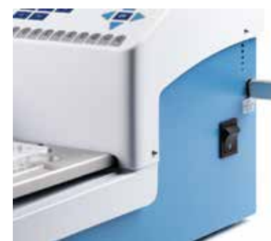
Wellwash Versa with a USB flash memory stick