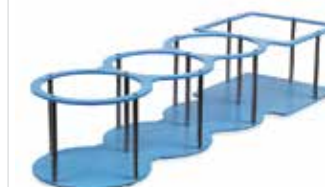
Bottle stand 1 x 4 configuration Wellwash Versa