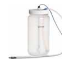
2 l wash bottle