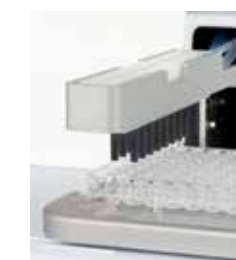
Wellwash Versa with two 1 x 8 wash heads