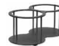
Bottle stand 1 x 2 configuration Wellwash