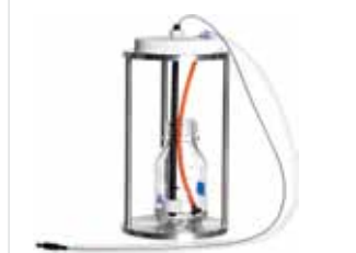
Bottle stand for user bottles