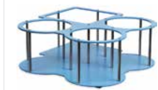
Bottle stand 2 x 2 configuration Wellwash Versa