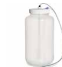
4 l wash bottle