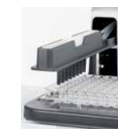
Wellwash with 1 x 8 wash head