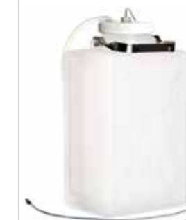
9 l waste bottle