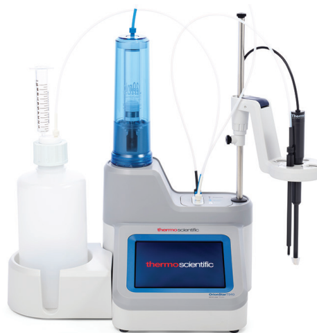
Orion Star T930 ISE Titrator with 20 mL burette