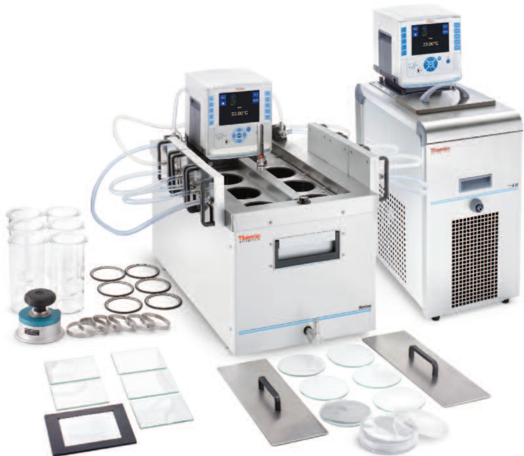
Thermo Scientific fog testing system

The term “fogging” primarily refers to the evaporated volatile organic compounds of vinyl (PVC), textiles or leather condensing onto glass. These materials are used to a great extent for the interior components of motor vehicles. High temperatures, such as those possible in a closed vehicle sitting in direct sunlight, accelerate the evaporation process and the VOC vapors trapped within the vehicle then condense on the windows and the windshield, possibly impairing the view and causing dangerous driving conditions. As the evaporation continues over time the VOC content depletes resulting in material fatigue and premature aging where the interior components become hard and brittle.