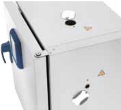
Additional access ports top and right