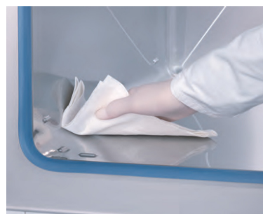
Smooth inner chamber with easy to clean rounded corners