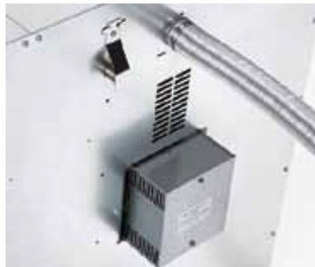
Underbench installation kit

Custom solutions available for table top ovens cable testing applications, clean room applications, and inner casing with conditional gas-tightness for inert gas applications. Access ports can be provided for large capacity ovens at preferred positions