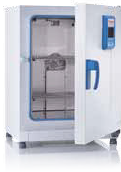
All Heratherm Advanced Protocol Security ovens are available in coated or stainless steel exterior. (model 100 L shown)