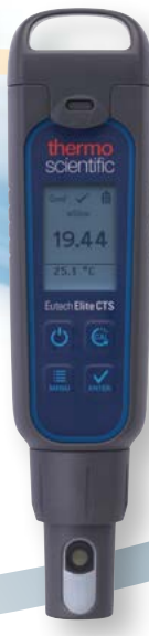
Elite CTS Tester (Cup)