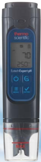
Expert pH Tester