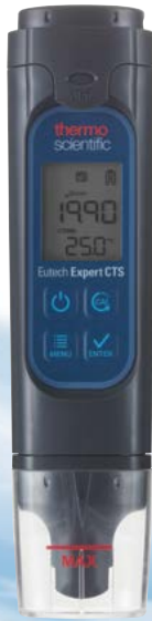
Expert CTS Tester (Pin)