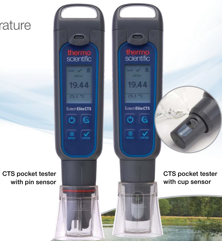
CTS pocket tester with pin sensor

The Elite CTS pocket tester simultaneously displays conductivity, total dissolved solids (TDS) or salinity with temperature. These measurements are ideal in applications such as environmental, agriculture, aquaculture and aquariums, hydroponics, pools and spas, education, and industrial (cooling towers). Applications in these industries may require a constant measurement of salinity and TDS. Select the cup sensor to read samples using a fillable tester or the pin sensor to read samples using a direct-insert tester.