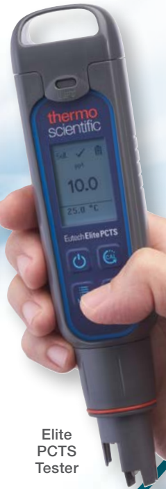
Elite PCTS Tester