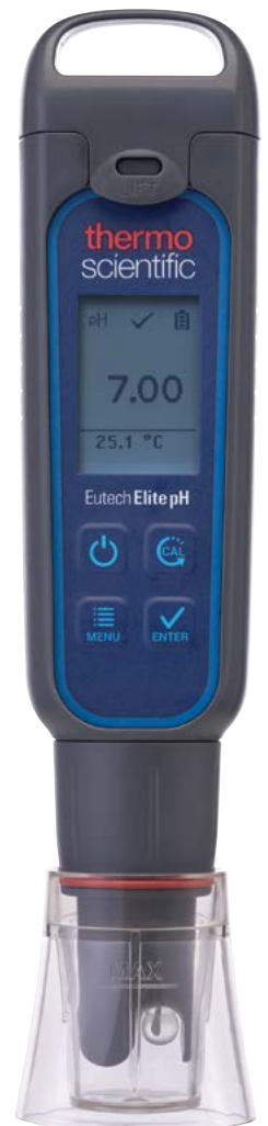
Elite pH Pocket Tester

Storage Wide, stable base allows the tester to stand independently