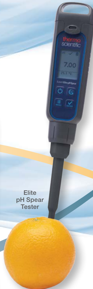
Elite pH Spear Tester