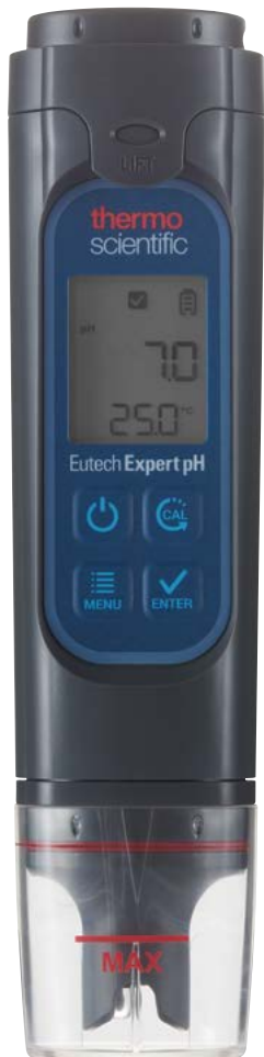
Expert pH Pocket Tester