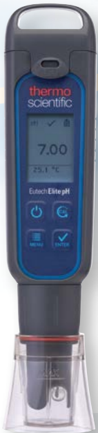
Elite pH Tester