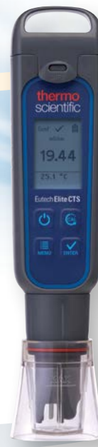
Elite CTS Tester (Pin)