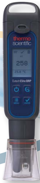
Elite ORP Tester