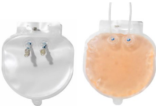
Thermo Scientific™ CentriPAK™ BPC Single

Use of unique, single-use Thermo Scientific™ CentriPAK™ BioProcess Containers (BPC) and the Thermo Scientific™ Sorvall™ BIOS 16 Centrifuge is an excellent method to pre-clarify supernatants prior to depth filtration or downstream processing. This method reduces overall processing time by eliminating pre-setup and post-cleaning steps as well as avoiding in-process clog-based delays. The sterilized, closed system ensures confidence in culture yield and purity. In this example, we harvest supernatant from a 50 L mammalian culture.