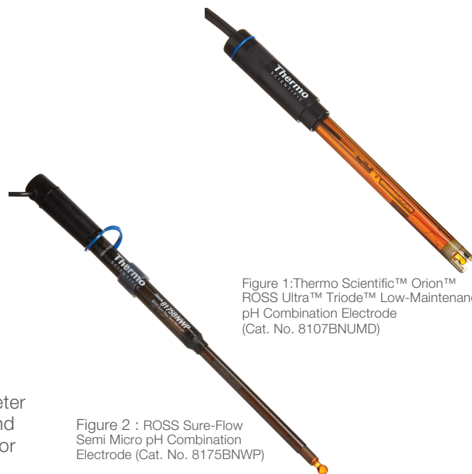
Figure 1: Thermo Scientific™ Orion™ ROSS Ultra™ Triode™ Low-Maintenance pH Combination Electrode (Cat. No. 8107BNUMD)