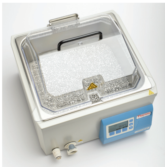
Precision™ General Purpose Water Bath TSGP10

Thermal beads are small aluminum alloy beads that act as a thermal conductor. Because of the size, shape and density of the beads, vessels of any size or shape that fit into the bath can be held in place by the beads without floating. The beads reduce the risk of contamination because there is no liquid to circulate the contamination to the other vessels or promote biogrowth and they can be sterilized chemically.