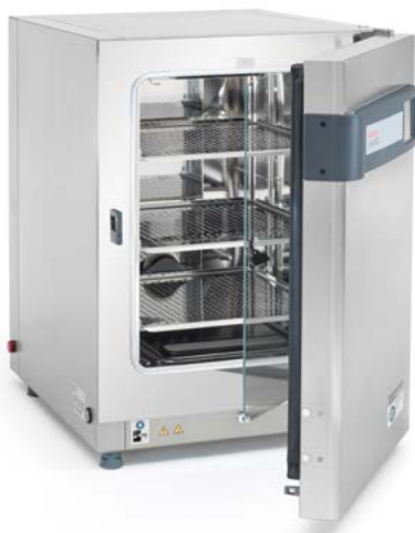
Thermo Scientific™ Heracell™ Vios™ CR CO 2 Incubator

Particulates sourced from equipment can be due to materials of construction, including painted surfaces, plastics, insulation and packaging materials, glass, metal parts with sharp edges, or crevices that could harbor microorganisms. It is difficult to estimate the number of particulates that could come from a given instrument; the only way to know for sure is by testing. And, for unbiased data, that testing should be performed by an independent third party, not by the manufacturer.