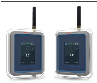
Thermo Scientific™ Smart-Vue™ Pro Remote Monitoring System