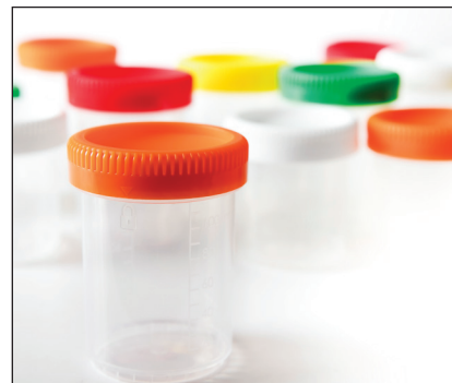
Thermo Scientific™ Samco™ Clicktainer™ Vials and Specimen Containers