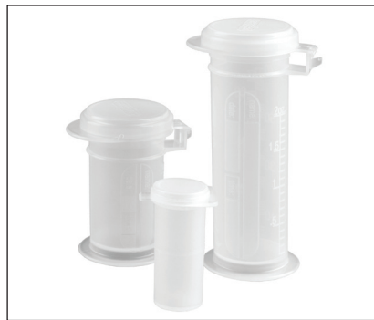
Thermo Scientific™ Capitol Vial Snappies™ Breast Milk Container System