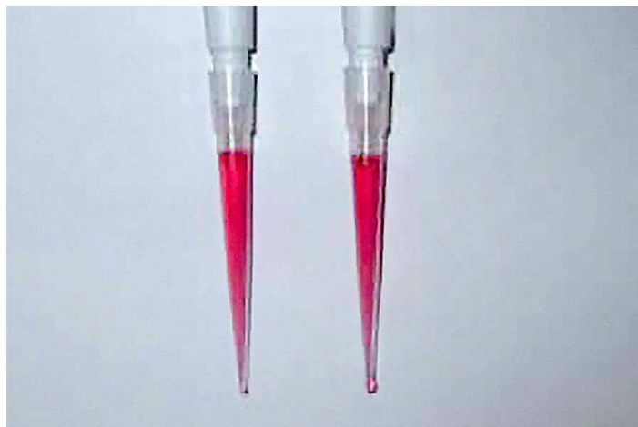
Figure 2. Evaporation causes the liquid to squeeze through the tip orifice if the tip is not pre-wetted. On the right a dry tip, and on the left a pre-wetted tip with a colored ethanol solution 15 s after the aspiration.

The physical properties of liquids may cause notable deviations in liquid handling processes unless they are taken into account. These properties cause different behaviors in liquid dosing, depending on the situation. It is possible to reduce the observed effects by changing, for example, the pipetting speed and pipetting technique. It should be kept in mind, however, that liquid properties are not the only influencing factors, but the result is always a combination of different phenomena. Therefore, a calibration should be performed to confirm the actual effect.