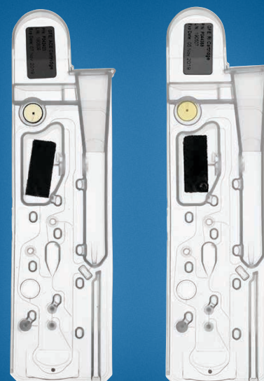
RapidHIT ID sample cartridges

RapidHIT ID sample cartridges provide the ability to run samples as they are received. No more batching.