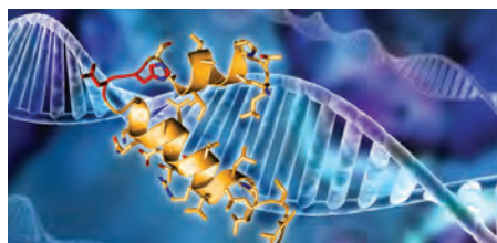
Invitrogen™ GeneArt™ Precision TALs