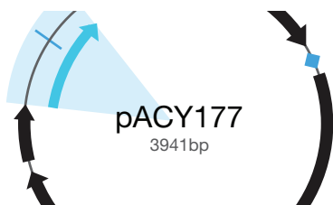
Invitrogen™ Vector NTI™ sequence analysis software

Our comprehensive portfolio of industry-leading brands and products for research and development includes: