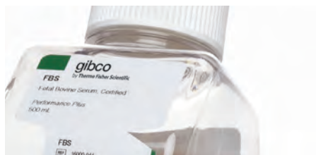
Gibco™ cell culture products