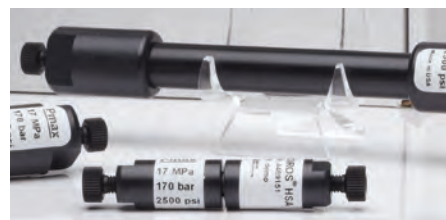
Applied Biosystems™ POROS™ chromatography resins

The Ion™ S5 Next-Generation Sequencing System: Simplicity. Speed. Scalability.