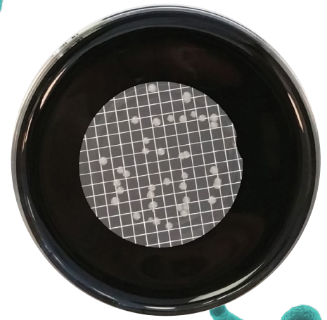
Legionella pneumophila growing on Legionella BCYE Agar with filter

This guide describes the Thermo Scientific™ Microbiology products that are commonly used for the detection and enumeration of Legionella in water.