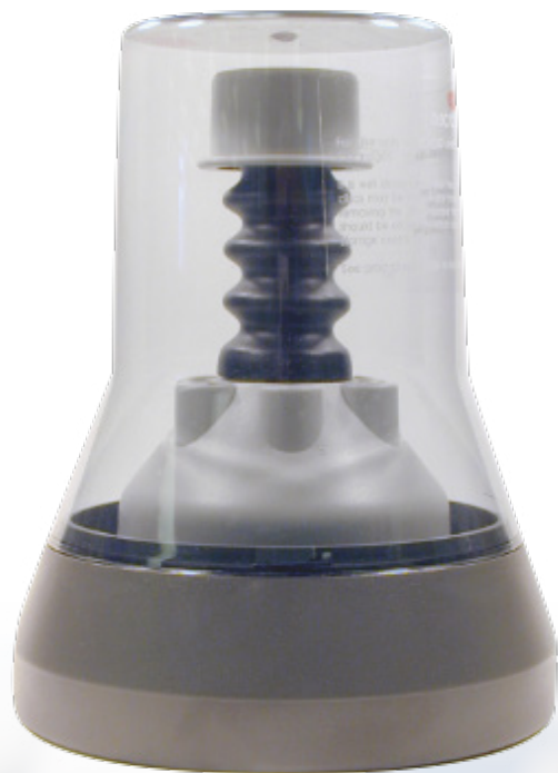
Thermo Scientific™ Oxoid™ Disc Dispenser

Oxoid discs are backed by over 50 years of experience in antimicrobial susceptibility disc development and production. We maintain close relationships with many pharmaceutical companies and introduce new discs to the market in a timely manner when new compounds become available.