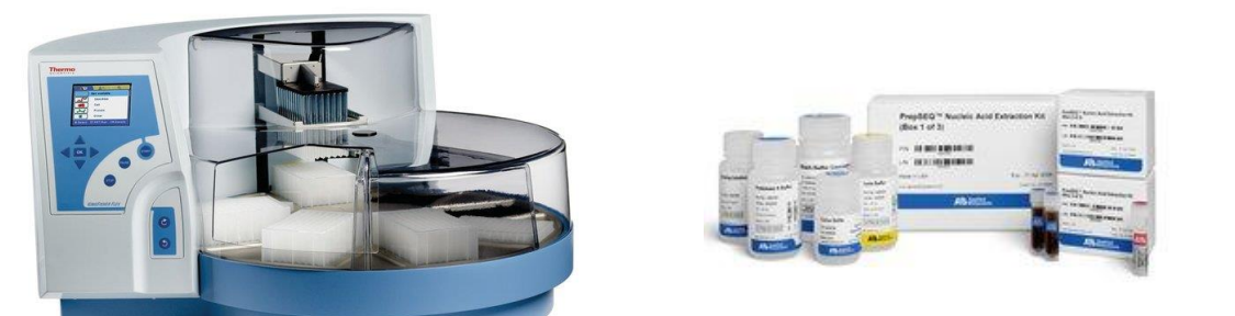
Figure 1. KingFisher Flex purification system and Applied Biosystems™ PrepSEQ™ Nucleic Acid Extraction Kit for Food and Environmental Testing

The KingFisher Flex is an automated magnetic particle-based system for DNA, RNA, protein and cell purification for samples of various origin. The magnetic particle technology combines the speed and efficiency of automation with high quality purification capability. The KingFisher technology uses magnetic rods to transfer particles through various purification phases of binding, mixing, washing and elution, offering a solution with minimal hands-on time.